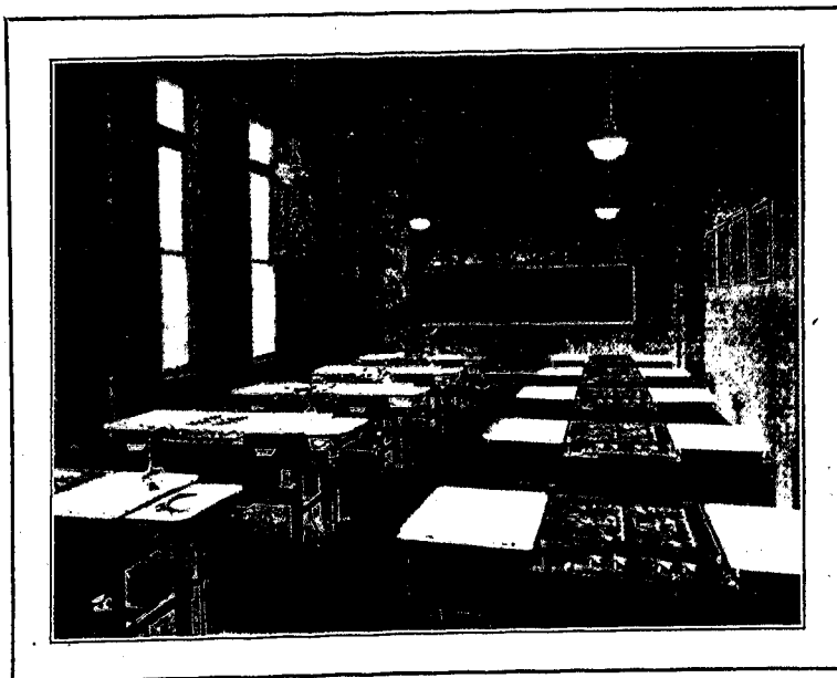
THE DIETETIC LABORATORY, MONTREAL GENERAL HOSPITAL.

agreement for five years, whereby the destinies of the Montreal General Hospital, now amalgamated with the Western Hospital and the Royal Victoria Hospital, now amalgamated with the Montreal Maternity Hospital, will be guided by a joint commission, composed of five members of the Board of Management of the Montreal General Hospital, five members of the Royal Victoria Hospital, and one representative from McGill University. While each hospital will retain its own autonomy, this commission will have power to decide on the erection of new buildings, raising of campaign funds and their distribution and correlation for teaching purposes, of medical appointments of the individual hospitals in connection with McGill University.